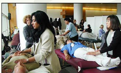
Reiki practitioners treat faculty and staff from Columbia University Health Sciences and New York-Presbyterian Hospital at Employee Health and Wellness Day

Excerpts from “Holistic Reiki” to be published in March 2015.