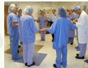
Doctors and nurses at Cordoba Hospitals, Spain in a Reiki circle before surgery